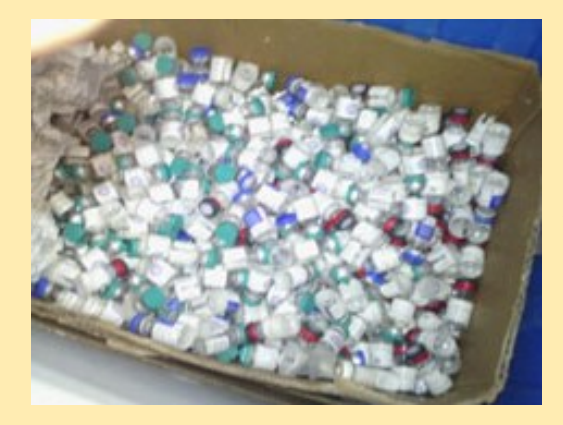
Inappropriate vaccines handling before training (left) and proper storage in refrigerator after training (right)

L10K's expanded program on immunization (EPI) is a USAID funded intervention which is carried out in partnership with the Federal Ministry of Health. The intervention aims to contribute to the reduction of incidences of vaccine preventable diseases. It works to increase access, demand, and utilization of immunization service and provide potent vaccines to children.