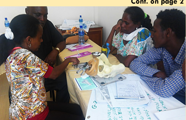
Family planning training