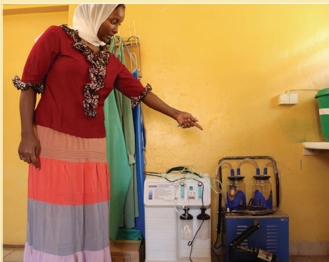
Shebe Health Center received suction machine (right) and oxygen concentrator (left) from L10K/USAID.