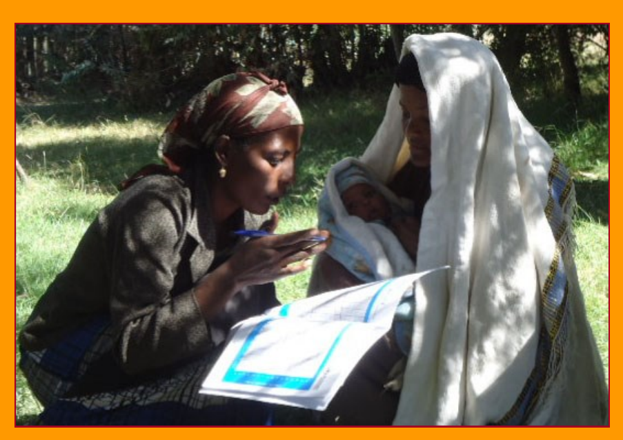
Referring to the growth monitoring graph on the family health card

Today, HEWs identify faltering growth earlier on before malnutrition occurs. Over 90 percent (which was less than 40 percent before April 2013) of children under two years in the Bakelay kebele are now regularly monitored for their growth status and their mothers counselled, accordingly. Mothers have improved their caring practices through proper breast feeding and complimentary feeding and contributed to lowering underweight prevalence. The health center has improved its linkage with its health posts and closely monitors growth . It works with HEWs to improve performance in community based nutrition which has helped improved outcomes of child health interventions.